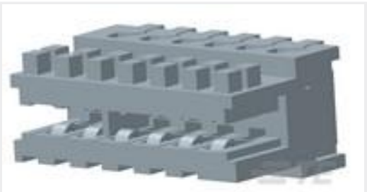
TE Part #3-284932-6 DUOPLUG MKI STD,6 POS, KEYED 4