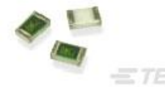
TE Part #4-1879140-2 RN 0603 49K9 0.1% 10PPM 5K RL