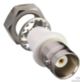
TE Part #CONBNC004 BNC Jack 50 Ohm Panel Mount