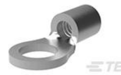
TE Part #34107-1 TERMINAL,SOLIS R 22-16 6