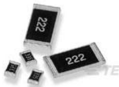
TE Part #1-2176177-5 CRGH0603 1% 2K2 0.2W