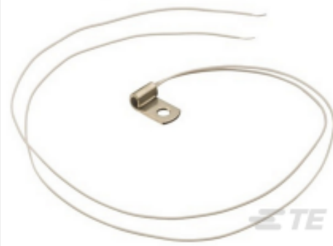
TE Part #GA10K4D25 PRO2-PROBE