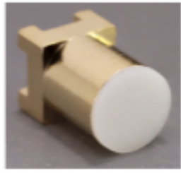
TE Part #CONMMCX001-SMD MMCX Jack 50 Ohm PCB Surface Mount