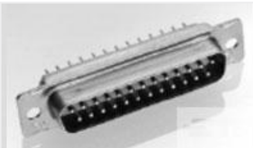
TE Part #205167-1 RECEPT ASSY,37 POSN,AMPLIMITE