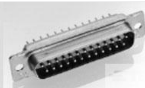
TE Part #1757827-1 AMPLIMITE,PLUG ASY,POSTD,109,ZN, 1