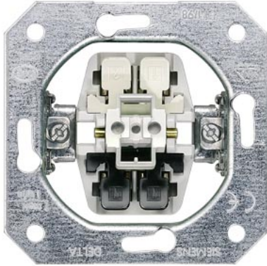
DELTA switch device insert FM, intermediate switch can be screwed, 10A 250V