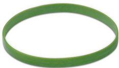
Color coding, color: green

https://www.phoenixcontact.com/in/products/1620588