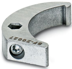
Hook wrench, series: RC, UC, RF, SF

https://www.phoenixcontact.com/in/products/1607455