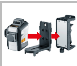
Stand-alone device or in combination: clamp and wall bracket