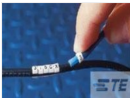
TE Part # 001308-000 STD06Y-L