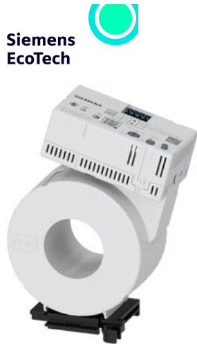
summation current transformer type B 35 mm, shielded