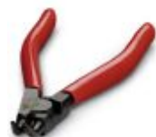
Contact removal tool for HC-M-EMV contact carriers

Contact removal tool - HC-M-EMV-KON-EWZ - 1678635