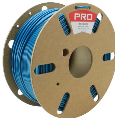
RS Stock No:2325366