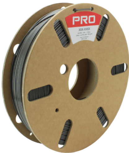
RS Stock No:2325353