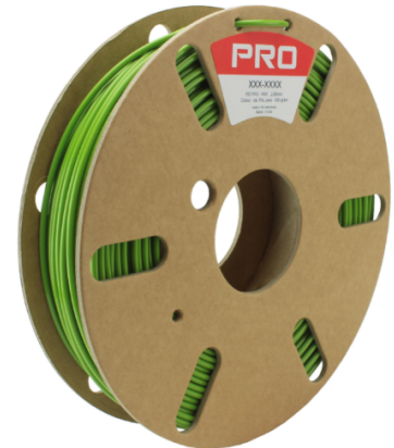
RS Stock No:2325367