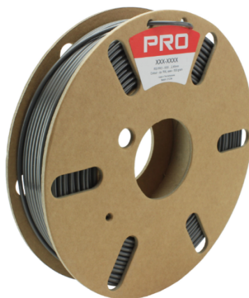
RS Stock No:2325369