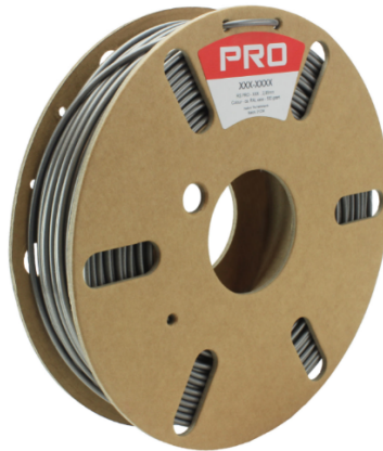
RS Stock No:2325375