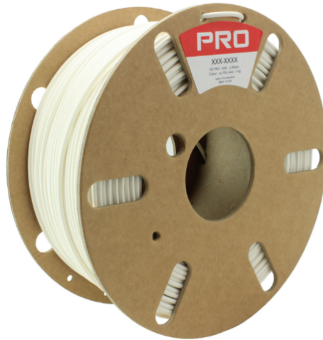
RS Stock No:2325378