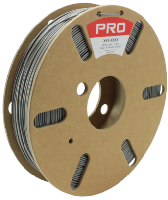
RS Stock No:2325359