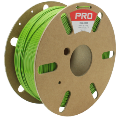
RS Stock No:2325352