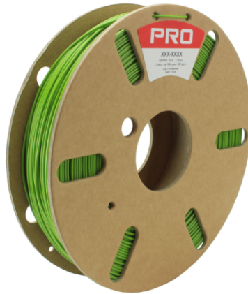
RS Stock No:2325350