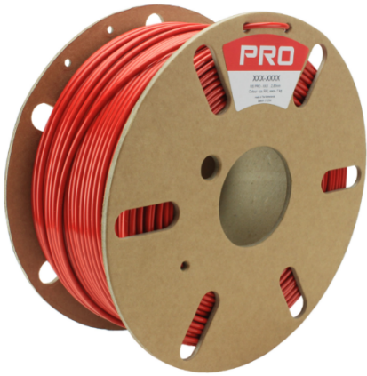
RS Stock No:2325374