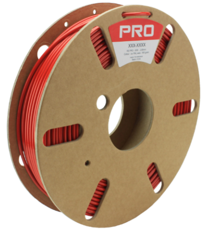
RS Stock No:2325373