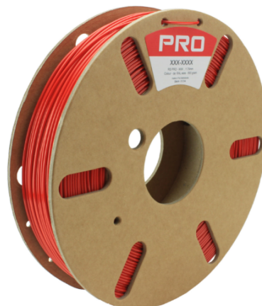
RS Stock No:2325357