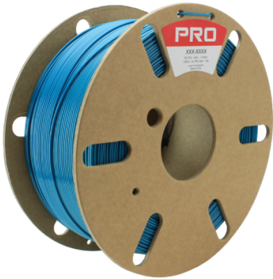
RS Stock No:2325349