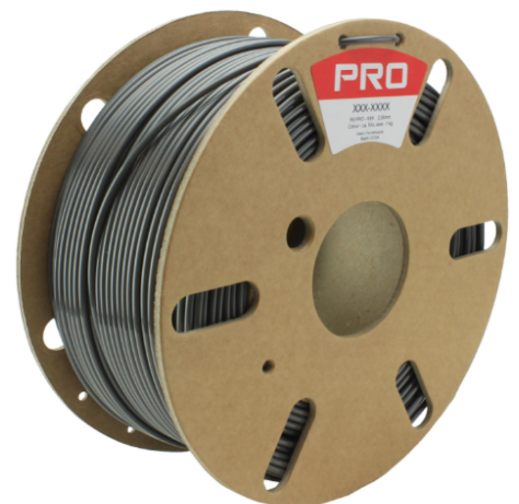
RS Stock No:2325370