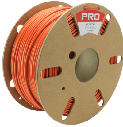
RS Stock No:2325372