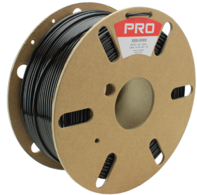
RS Stock No:2325364