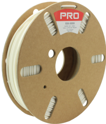
RS Stock No:2325377