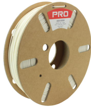
RS Stock No:2325361