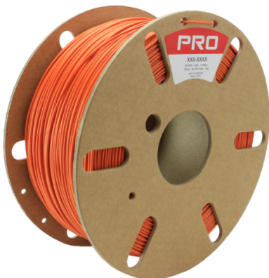
RS Stock No:2325356