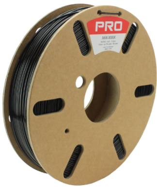
RS Stock No:2325346