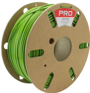
RS Stock No:2325368