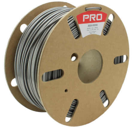
RS Stock No:2325376