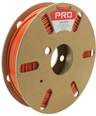
RS Stock No:2325371