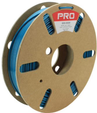
RS Stock No:2325365