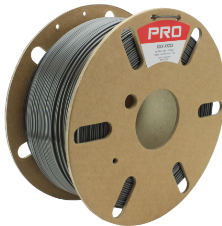
RS Stock No:2325354