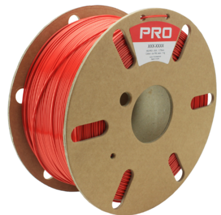
RS Stock No:2325358