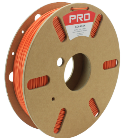
RS Stock No:2325355