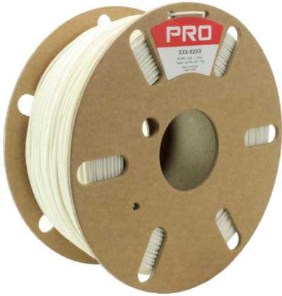
RS Stock No:2325362