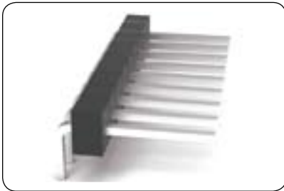
Right Angle / Breakaway Header**