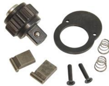
4603 repair kit