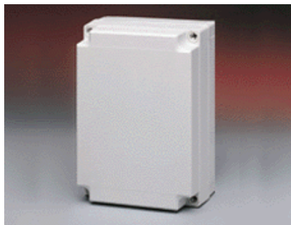
This is a sample photo.