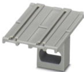
Flange cover, for direct mounting below, length: 29.1 mm, width: 22 mm, height: 12.8 mm, color: gray

Please be informed that the data shown in this PDF Document is generated from our Online Catalog. Please find the complete data in the user's documentation. Our General Terms of Use for Downloads are valid ( http://phoenixcontact.com/download )