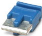
Single plug-in bridge, length: 6 mm, number of positions: 2, color: blue

Single plug-in bridge - FBST 6-PLC BU - 2966812