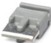
Single plug-in bridge, length: 6 mm, number of positions: 2, color: gray

Single plug-in bridge - FBST 6-PLC GY - 2966825