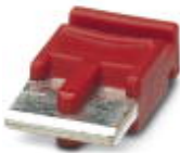
Single plug-in bridge, length: 6 mm, number of positions: 2, color: red

Single plug-in bridge - FBST 6-PLC RD - 2966236