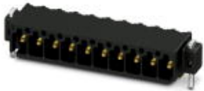
The illustration shows the 10-position version

Header, Nominal current: 6 A, Rated voltage (III/2): 160 V, Number of positions: 13, Pitch: 2.54 mm, Color: black, Contact surface: Gold, Mounting: Taped SMD/THT/THR components, Fixed coding of the last position, can be combined with the FMC 0,5/...-ST-2,54 C2 connector