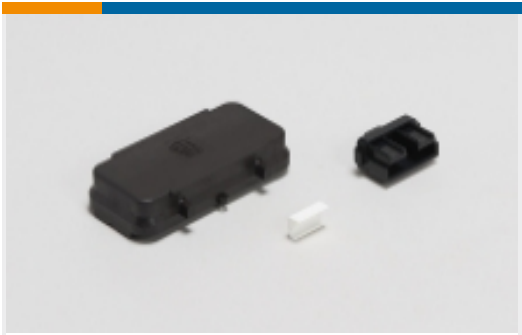
Rectangular Caps & Covers(4)