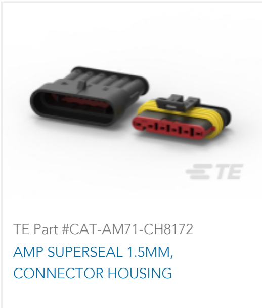
TE Part #CAT-AM71-CH8172 AMP SUPERSEAL 1.5MM, CONNECTOR HOUSING