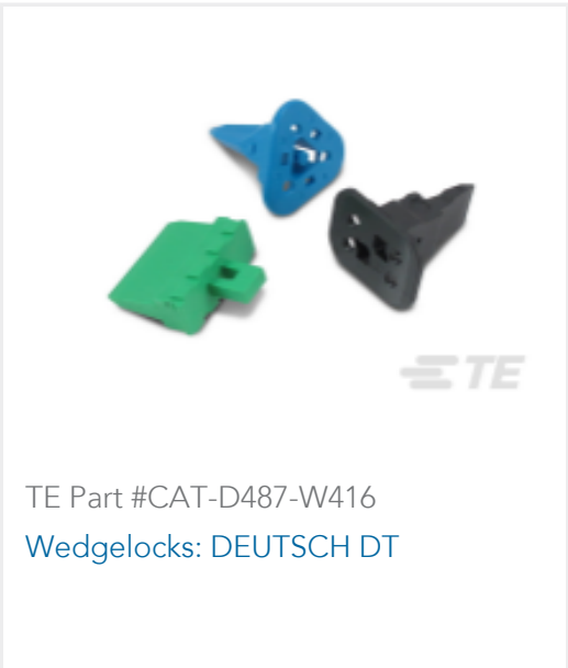
TE Part #CAT-D487-W416 WedgeLocks: DEUTSCH DT