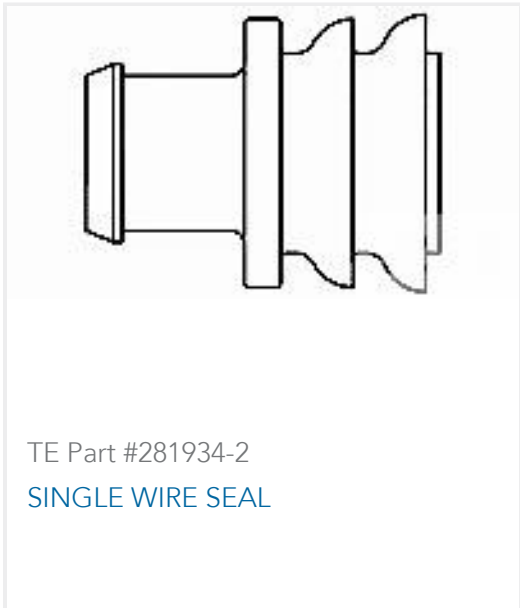
TE Part #281934-2 SINGLE WIRE SEAL