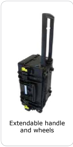
Extendable handle and wheels