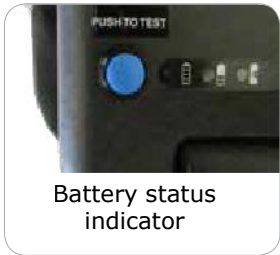
Battery status indicator