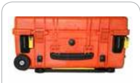
Optional orange case