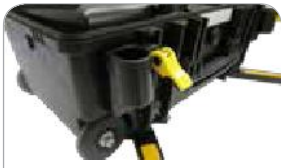
Quick lock /release