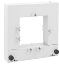
Current transformers DM2TA0300