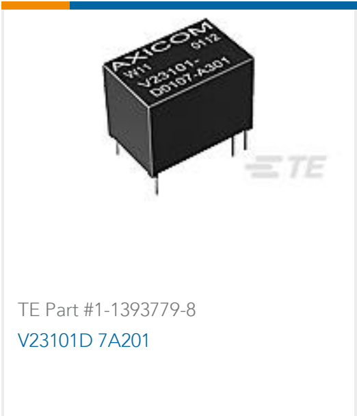
TE Part #1-1393779-8 V23101D 7A201