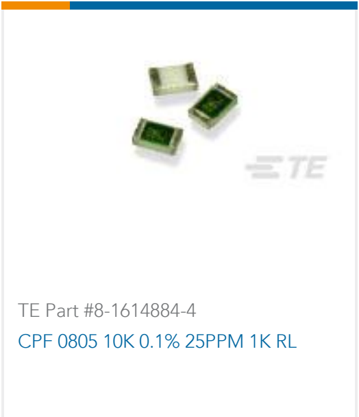
TE Part #8-1614884-4 CPF 0805 10K 0.1% 25PPM 1K RL