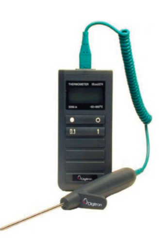
3208 IS Model

For other options, please contact us digitronsales@rototherm.co.uk or +44 (0)1656 740551