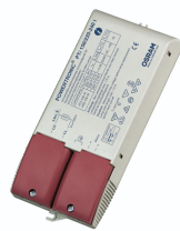
92200236499 POWERTRONIC INTELLIGENT PTi I 150/220...240 I