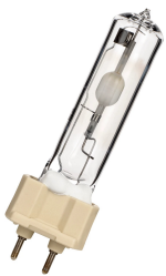
HMC150942T/01 MASTERC CDM-T 150W/942 G12