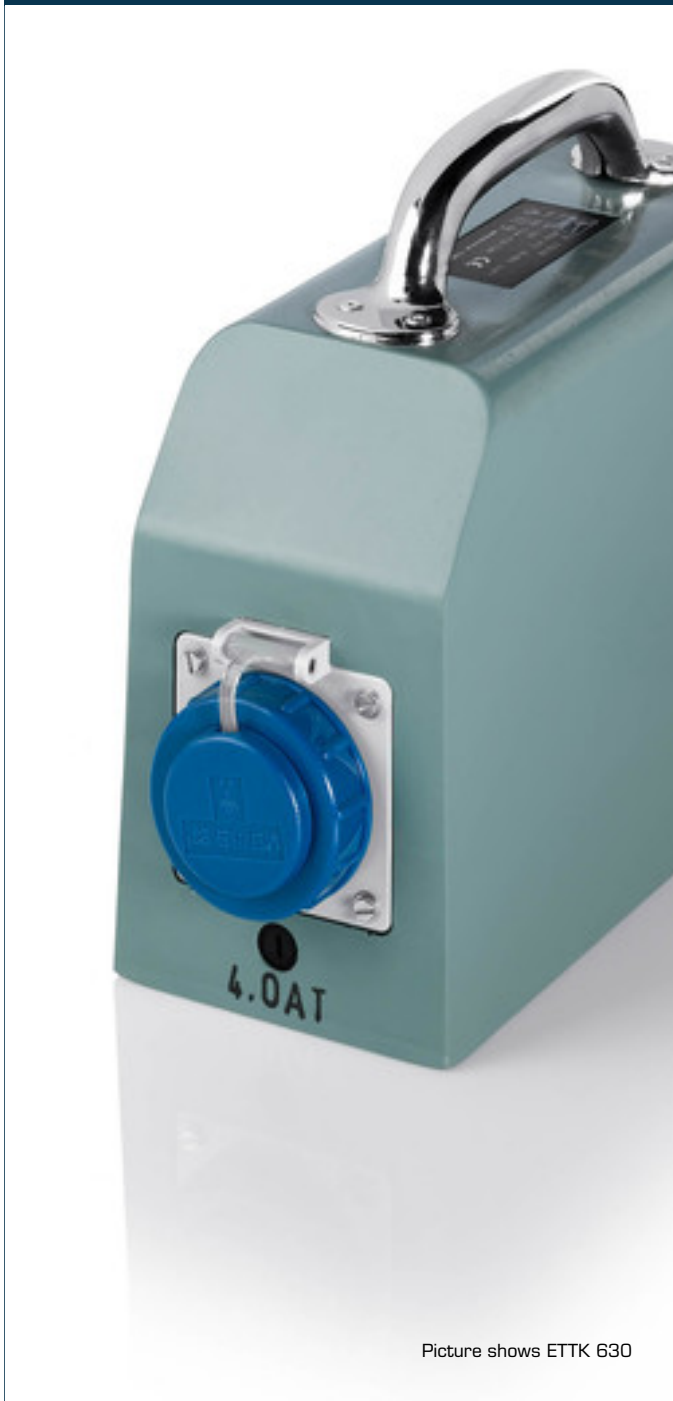
Picture shows ETTK 630