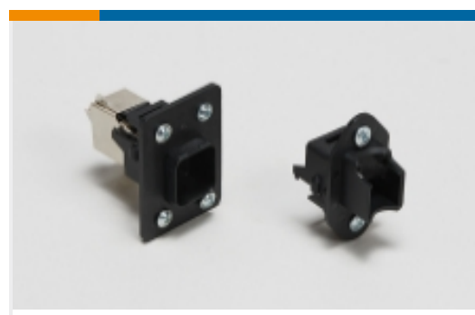
Circular Ethernet Hardware (2)