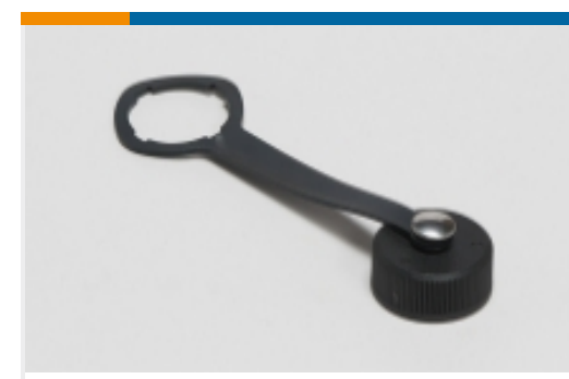
Modular Jack & Plug Caps & Covers(2)