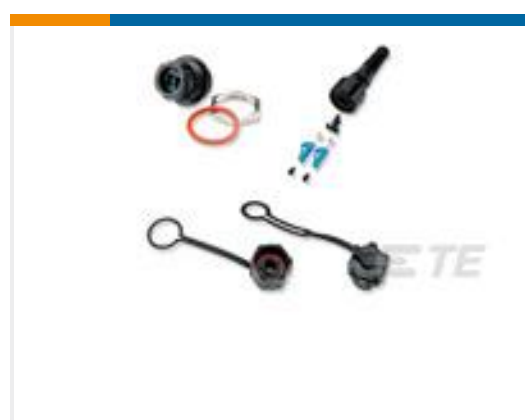
TE Part #1828740-1 ASSEMBLY, PROTECTIVE CAP