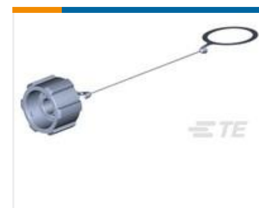
TE Part #2008618-1 Protective Cover Kit