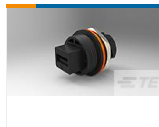
TE Part #1954643-1 Recpt Kit,Series A to Series A