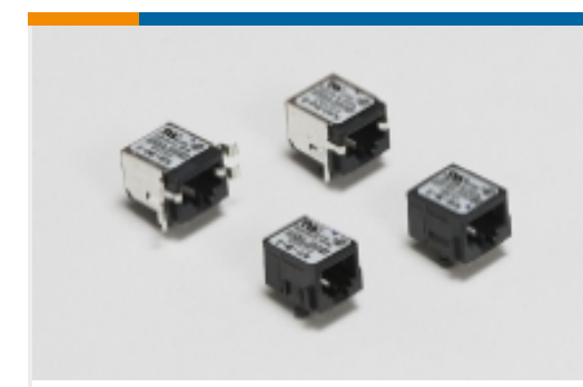
Modular Jack Filters(1)