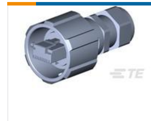
TE Part #1738607-1 KIT, PLUG, SOLID WIRE