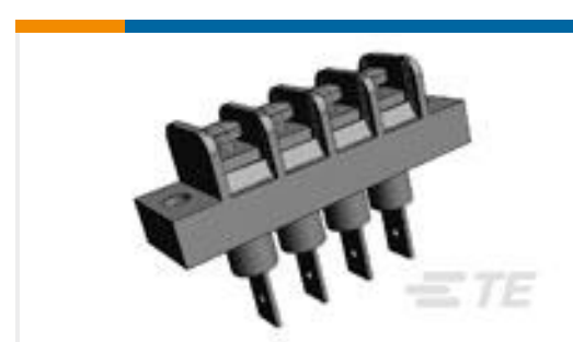
TE Part #5-1437665-3 JC6-Q307-04=JC6 ASSEMBLY