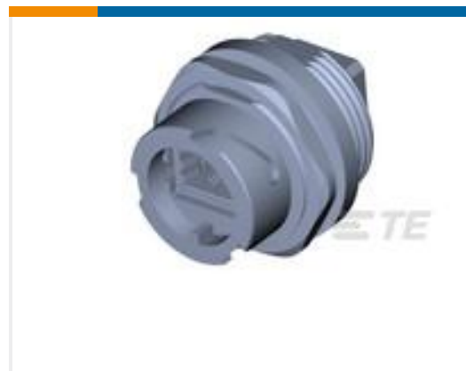
TE Part #1811689-1 Recptacle Kit,8 Pos Shielded