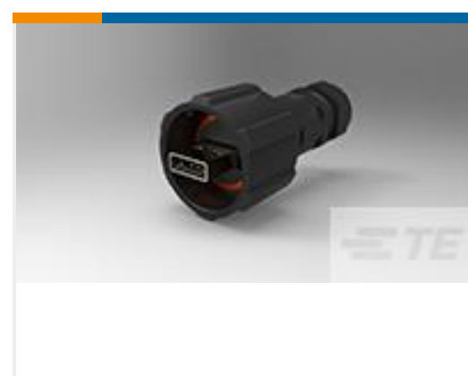
TE Part #1954637-1 Plug Kit,USB Series A