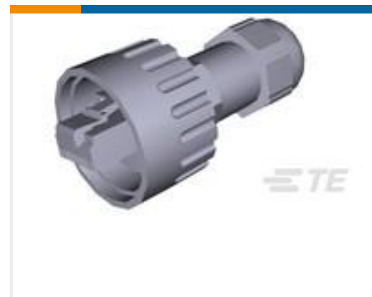
TE Part #1546440-1 ETHERNET FIELD ATTACHABL CONN