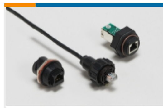
Circular RJ45 Connectors (22)