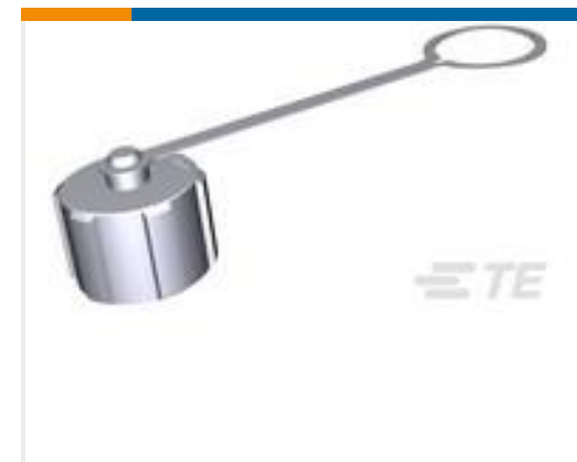
TE Part #1738611-1 PROTECTIVE COVER ASSEMBLY