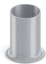
Ferrule, Length contact range: 12 mm, sleeve length: 12 mm, color: silver

Please be informed that the data shown in this PDF document is generated from our online catalog. Please find the complete data in the user documentation. Our general terms of use for downloads are valid.