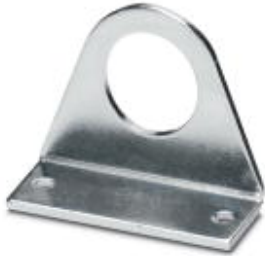
Fixing bracket for protective sleeves, fixed with two screws

Please be informed that the data shown in this PDF Document is generated from our Online Catalog. Please find the complete data in the user's documentation. Our General Terms of Use for Downloads are valid ( http://phoenixcontact.com/download )