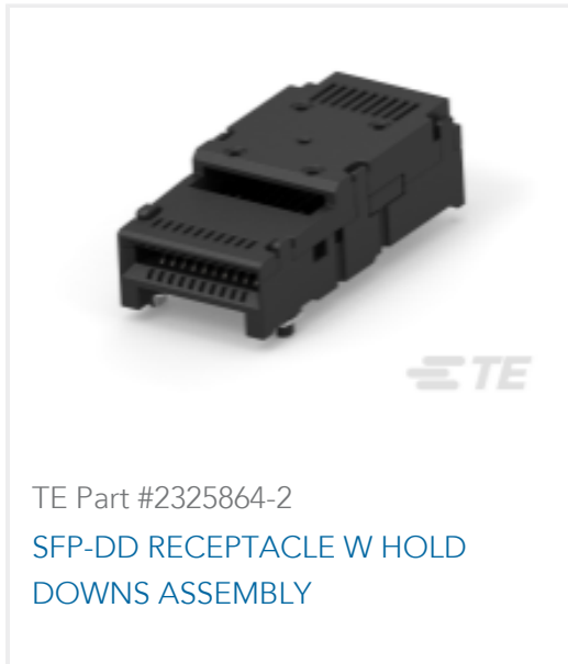
TE Part #2325864-2 SFP-DD RECEPTACLE W HOLD DOWNS ASSEMBLY