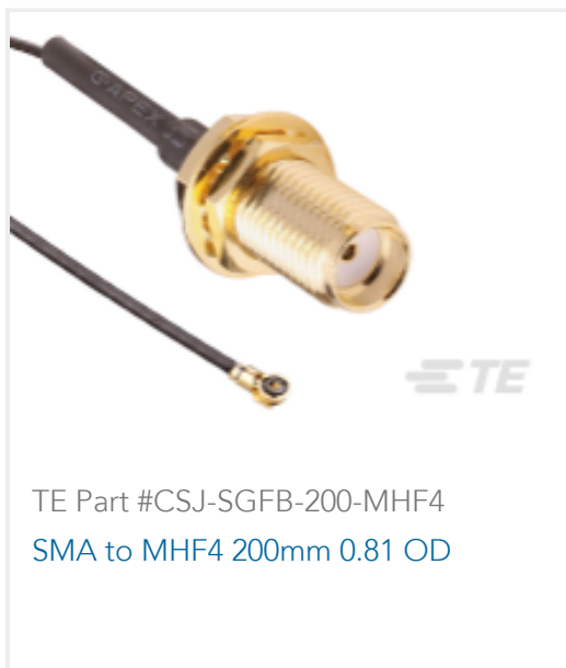
TE Part #CSJ-SGFB-200-MHF4 SMA to MHF4 200mm 0.81 OD