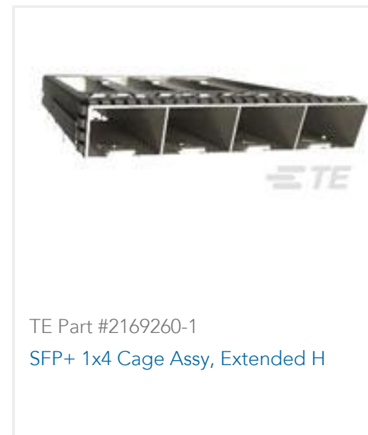
TE Part #2169260-1 SFP+ 1x4 Cage Assy, Extended H