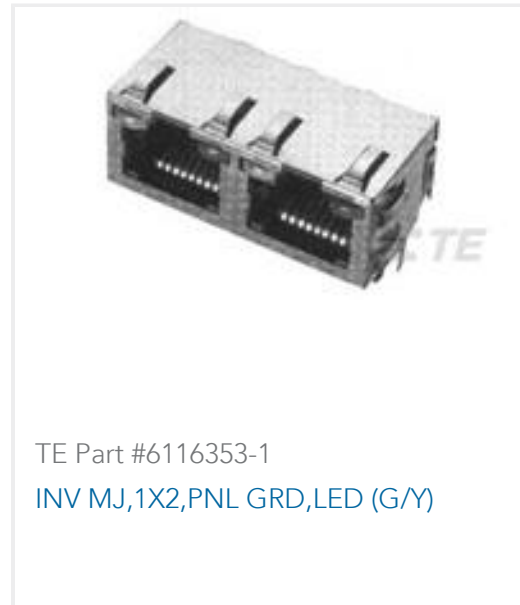
TE Part #6116353-1 INV MJ,1X2,PNL GRD,LED (G/Y)