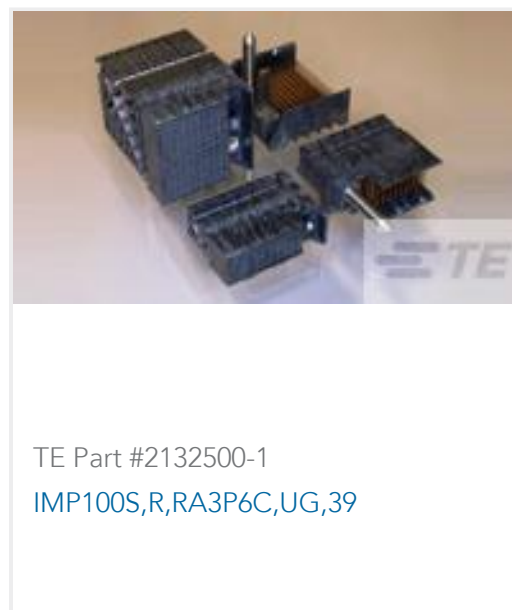
TE Part #2132500-1 IMP100S,R,RA3P6C,UG,39