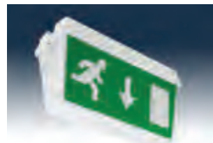
Drop down attachment c/w legend set (Arrows - 1x Left, 1x Right and 2x Down)