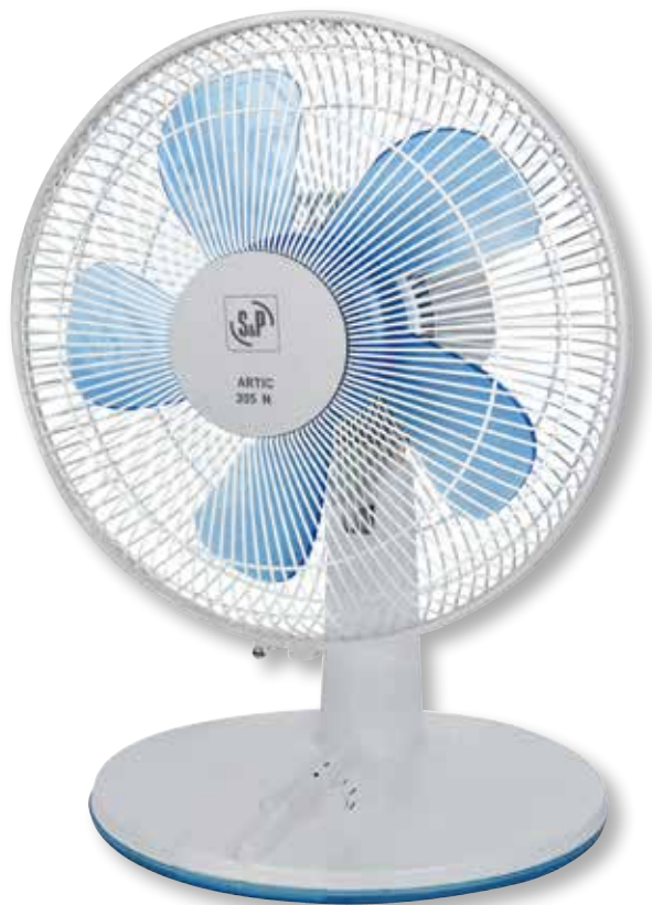
Table fans designed to offer a powerful and uniform distribution of air with a very quiet operation.