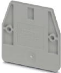
End cover, Length: 29.9 mm, Width: 2.2 mm, Color: gray

Please be informed that the data shown in this PDF Document is generated from our Online Catalog. Please find the complete data in the user's documentation. Our General Terms of Use for Downloads are valid ( http://phoenixcontact.com/download )