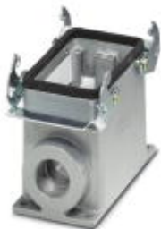
HEAVYCON box mounting base D50, with double locking latch, height 81 mm, with support 2xM32

Please be informed that the data shown in this PDF Document is generated from our Online Catalog. Please find the complete data in the user's documentation. Our General Terms of Use for Downloads are valid ( http://phoenixcontact.com/download )