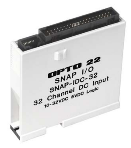
SNAP-IDC-32 high-density digital input module

All HDD input modules feature automatic counting and latching. The DC models are ideal for detecting low-voltage auxiliary contacts.