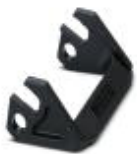
Replacement single locking latch for HEAVYCON EVO housing type B10, PA

Single locking latch - HC-B10-SL-PLBK - 1407698