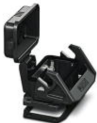
HEAVYCON EVO panel mounting base, plastic, B10, with single locking latch, height: 30.5 mm, with flat gasket, with protective cover

Please be informed that the data shown in this PDF Document is generated from our Online Catalog. Please find the complete data in the user's documentation. Our General Terms of Use for Downloads are valid ( http://phoenixcontact.com/download )