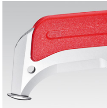
Guide shoe 98 55