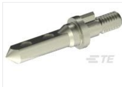
TE Part #1-1469491-3 MULTIGIG RT GUIDE PIN, 9MM 4.20