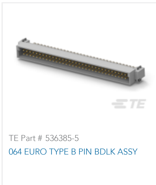
TE Part # 536385-5 064 EURO TYPE B PIN BDLK ASSY