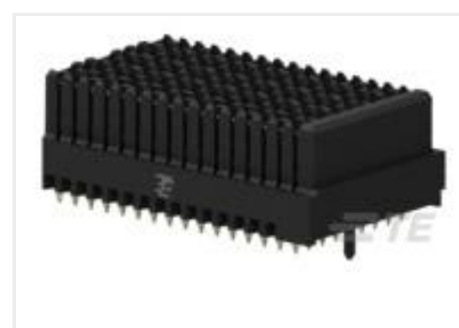
TE Part #2102737-1 BP, Right End, MULTIGIG RT 2R