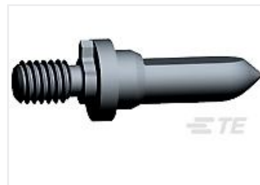
TE Part #2000676-3 Keyed Guide Pin, Mached, Vita 46