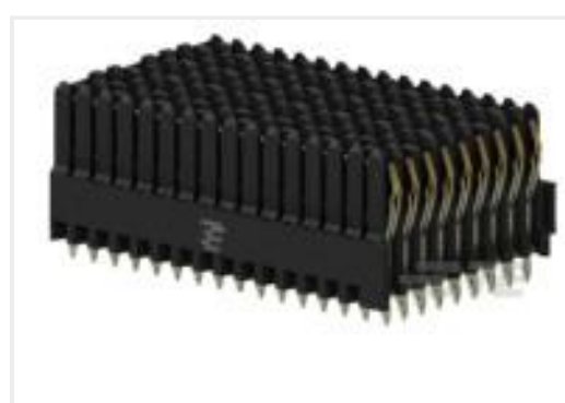
TE Part #2102736-1 BP, Center, MULTIGIG RT 2R