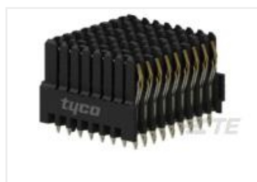
TE Part #2102735-1 BP, Half Left End, MULTIGIG RT 2R