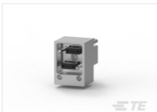
TE Part #2828383-1 CONN KIT,VITA66.4-DERIV,RCPT, DUAL-CAVITY