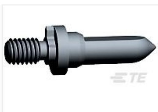
TE Part #2000676-4 Keyed Guide Pin, Mached, Vita 46