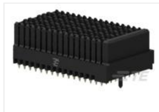
TE Part #1410142-1 MULTIGIG RT T2 .8" BP FULL RGH