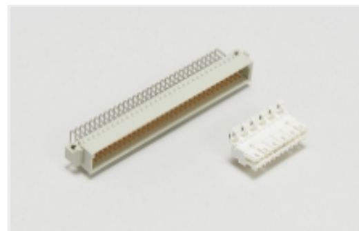
Standard Edge Connectors(2)