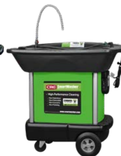
SW-37 Mobile Heavyweight Parts Washer