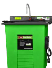
SW-25 Signature Parts Washer