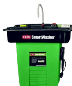
SW-28 SuperSink Parts Washer