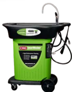
SW-23 Mobile Parts/Brake Washer