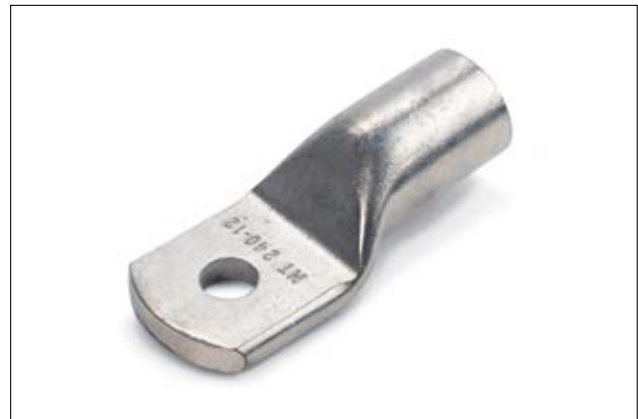
Copper lugs, CL series.

Copper cable lugs provide a reliable solution for terminating copper conductors in a wide range of electrical installations. Designed for general-purpose use, they accommodate various conductor sizes and are suitable for both high-performance systems and routine electrical work. Manufactured from 99.9% pure, high-conductivity copper and fully annealed, HellermannTyton lugs offer excellent ductility and mechanical strength, ensuring secure crimping without cracking under compression. The straight barrel design allows for easy conductor insertion and is compatible with both indent and hexagonal crimping tools. A tin-plated finish (5–10 microns) enhances corrosion resistance and electrical performance, supporting long-term reliability in harsh environments.