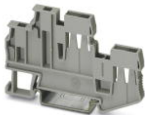
Self-locking flange, Width: 5.2 mm, Height: 40 mm, Color: gray, Mounting type: NS 35/7,5, NS 35/15

Please be informed that the data shown in this PDF Document is generated from our Online Catalog. Please find the complete data in the user's documentation. Our General Terms of Use for Downloads are valid ( http://phoenixcontact.com/download )