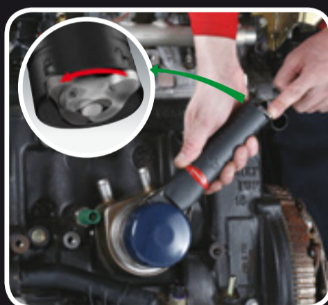
Position and release.