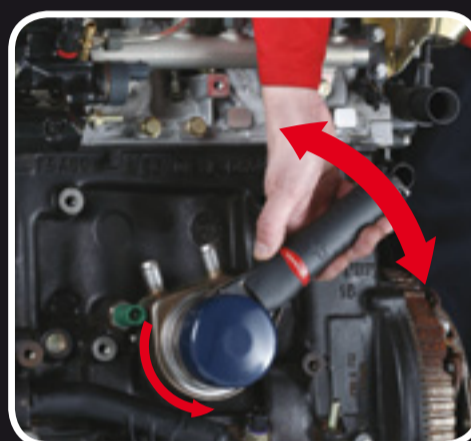
Ratchet effect ensures quick tightening and loosening.