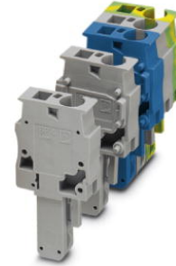
Illustration shows versions of the SP 4/1-... connector in various colors

Connector with spring-cage connection for self-assembly, middle element; cross section: 0.08 - 0.4 mm 2 , width: 6.2 mm, color: Gray