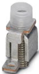
Step bracket, Number of positions: 2, Color: silver

Please be informed that the data shown in this PDF Document is generated from our Online Catalog. Please find the complete data in the user's documentation. Our General Terms of Use for Downloads are valid ( http://phoenixcontact.com/download )