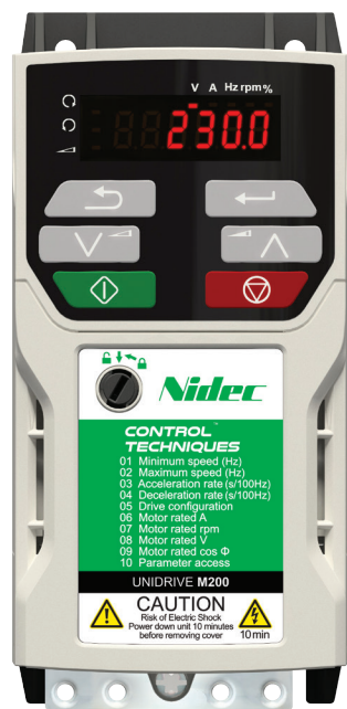
Unidrive M200 Frame Size 1