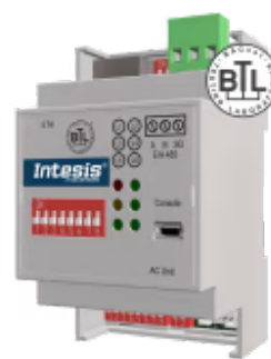
Daikin to BACnet/IP & MS/TP - 1 indoor unit

The Daikin-BACnet interface allows full bidirectional communication between Daikin domestic air conditioner units and BACnet/IP or MS/TP networks. The interface enables BACnet communication via polling or subscription requests (COV), making the indoor unit available through independent BACnet objects.