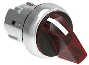
Illuminated selector switch actuator - 3 position LPSSL13