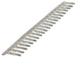
Rolled female contact, taped, silver-plated, 0.14 mm 2 ... 0.5 mm 2 left contact lead-in, 2000 pieces per roll

Please be informed that the data shown in this PDF Document is generated from our Online Catalog. Please find the complete data in the user's documentation. Our General Terms of Use for Downloads are valid ( http://phoenixcontact.com/download )