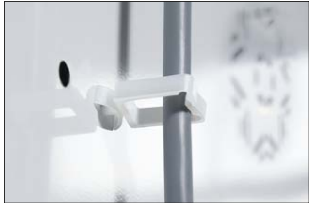
WPC – Wire Push In Clip.