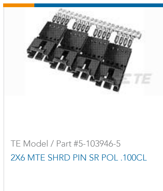
TE Model / Part #5-103946-5 2X6 MTE SHRD PIN SR POL .100CL