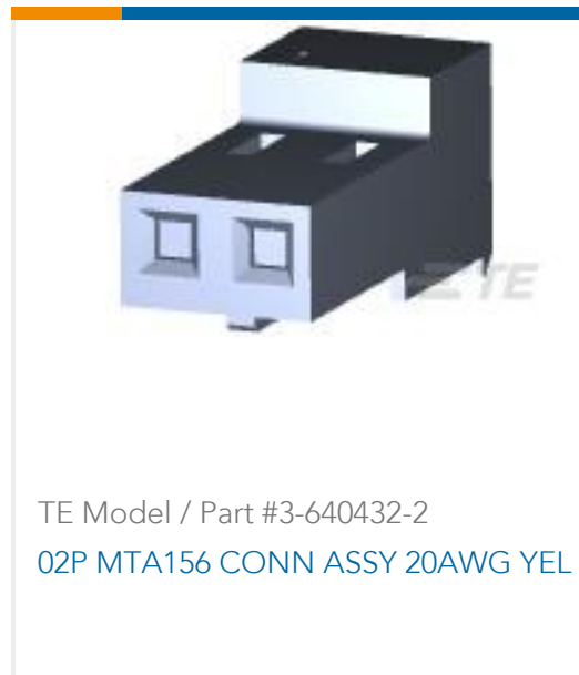
TE Model / Part #3-640432-2 02P MTA156 CONN ASSY 20AWG YEL