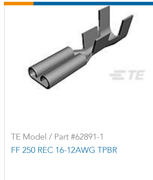
TE Model / Part #62891-1 FF 250 REC 16-12AWG TPBR