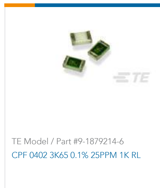
TE Model / Part #9-1879214-6 CPF 0402 3K65 0.1% 25PPM 1K RL