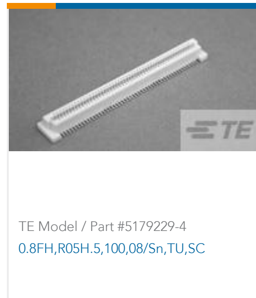
TE Model / Part #5179229-4 0.8FH,R05H.5,100,08/Sn,TU,SC