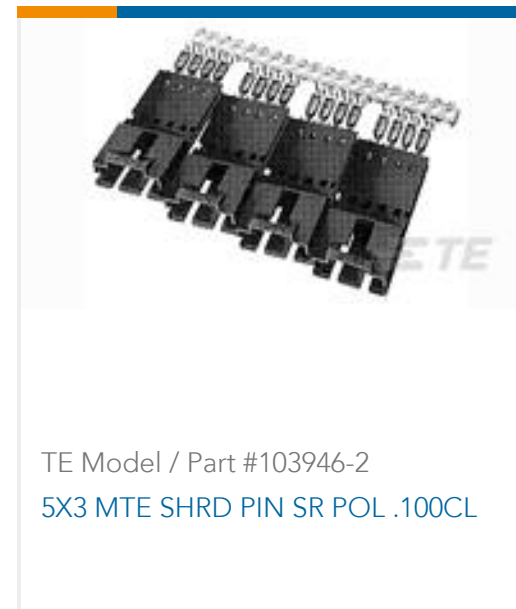
TE Model / Part #103946-2 5X3 MTE SHRD PIN SR POL .100CL