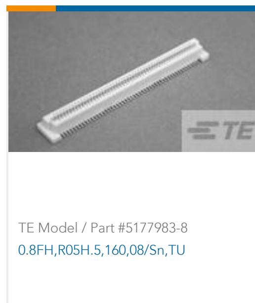
TE Model / Part #5177983-8 0.8FH,R05H.5,160,08/Sn,TU