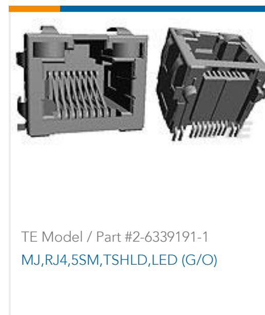
TE Model / Part #2-6339191-1 MJ,RJ4,5SM,TSHLD,LED (G/O)