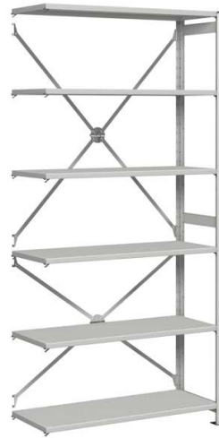
Euro Open Starter - Ext