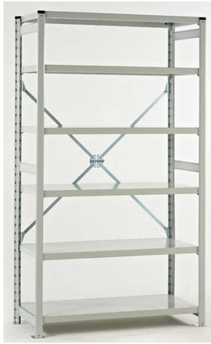
Euro Open Starter