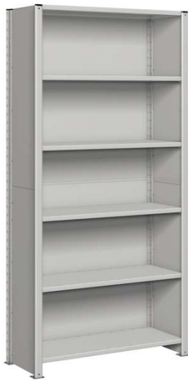
Euro Closed/Clad Starter