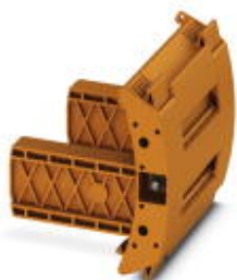
Dummy plug, color: orange

Please be informed that the data shown in this PDF Document is generated from our Online Catalog. Please find the complete data in the user's documentation. Our General Terms of Use for Downloads are valid ( http://phoenixcontact.com/download )