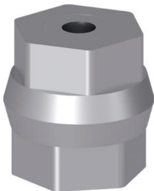
Post insulator for busbar 1-pole with internal thread M8 and fastening plate